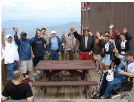
Enjoying the view

HHI relies on the community to support programs and provide funding to stretch tight budgets. S.C.O.A.P. is one specific area where donations can make a difference. Donations would enable more clients to participate.