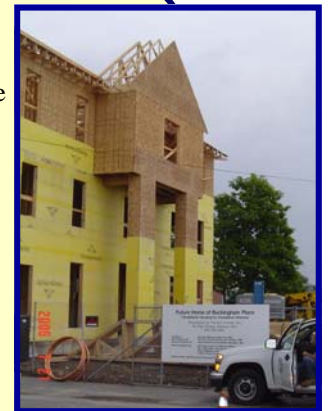
Building Update 07/06

The 20-unit apartment building will be one of the first in the nation to accommodate under one roof-homeless male and female veterans and their families. The new facility will allow Harbor Homes to continue providing the skills and resources enabling homeless veterans to become self-sufficient and productive members of the community.